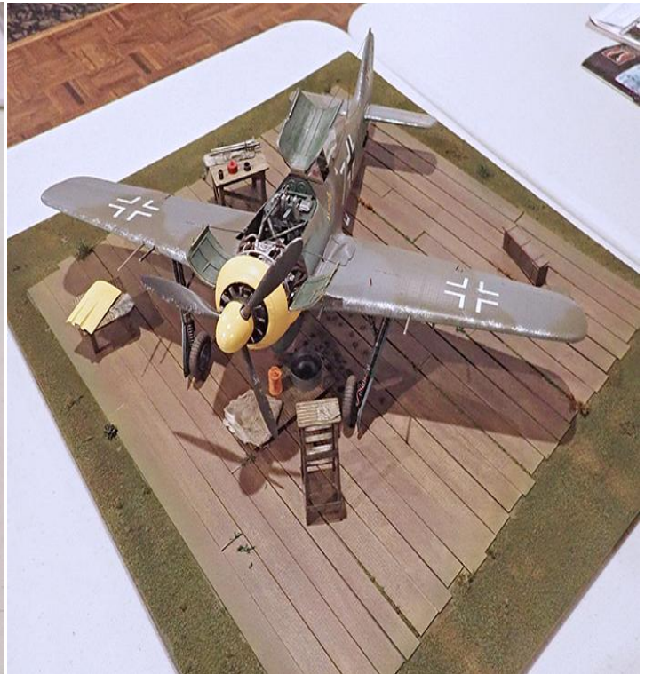
This super-detailed FW-190 was in 1/32 scale!