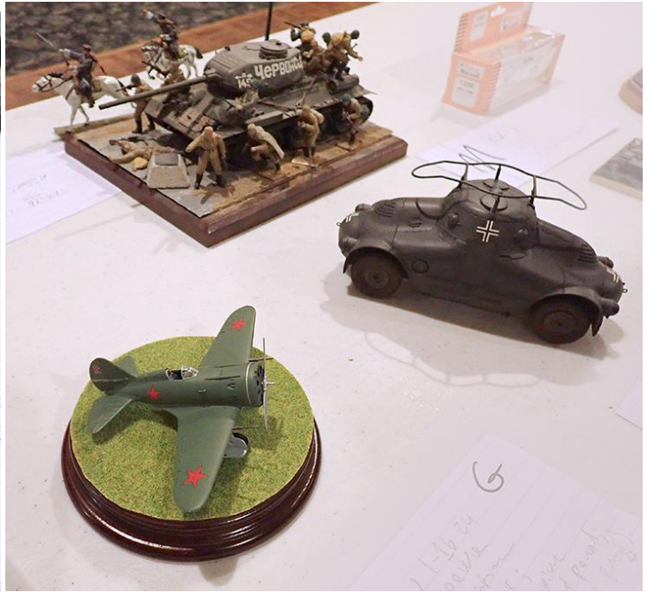
The battle scene, an I-16, and a Turtle.