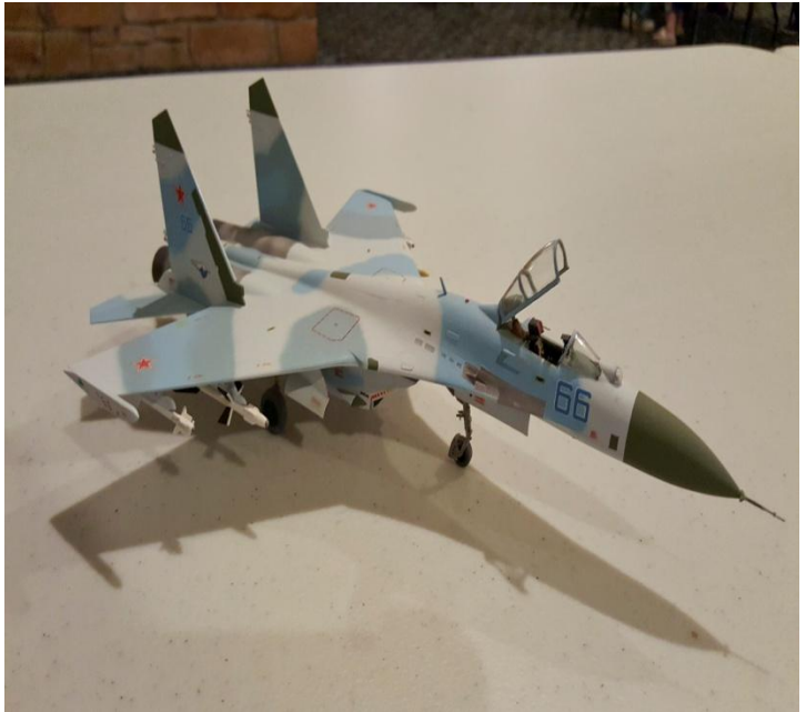
Modern Soviet Fighter