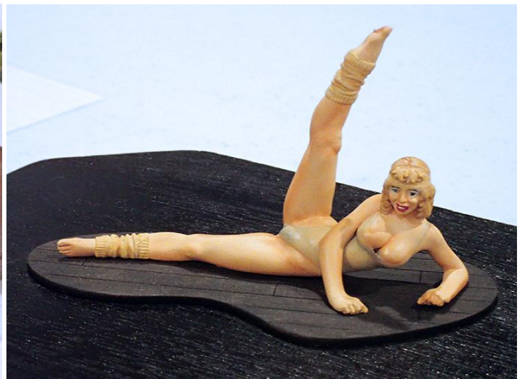
Big Bill's favorite Nurse!!!!!! LOL