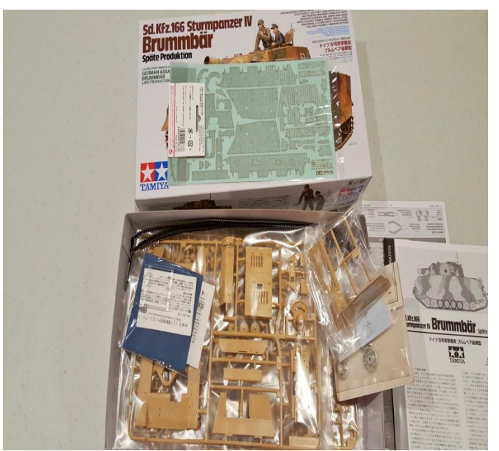
Brummbär with all the fixins'