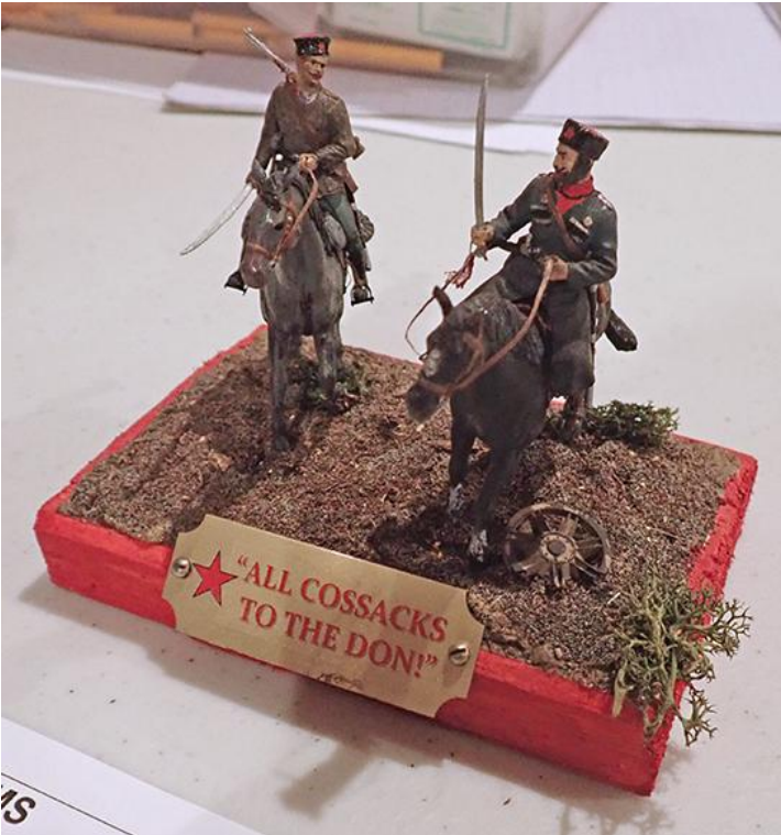
Cossacks intent on pillaging!