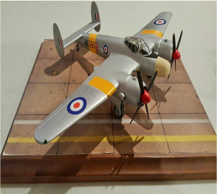
British Patrol Aircraft